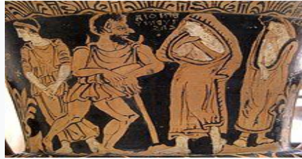
Charon (Greek) who guides dead souls to the Underworld. 4th century BCE.

In theological reference to the soul, the terms "life" and "death" are viewed as emphatically more definitive than the common concepts of " biological life " and "biological death". Because the soul is said to be transcendent of the material existence , and is said to have (potentially) eternal life , the death of the soul is likewise said to be an eternal death . Thus, in the concept of divine judgment , God is commonly said to have options with regard to the dispensation of souls, ranging from Heaven (i.e., angels ) to hell (i.e., demons ), with various concepts in between. Typically both Heaven and hell are said to be eternal, or at least far beyond a typical human concept of lifespan and time.