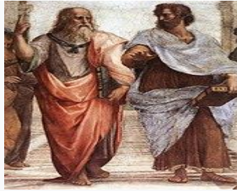
Plato (left) and Aristotle (right), a detail of The School of Athens , a fresco by Raphael .

Main article: Plato's tripartite theory of soul